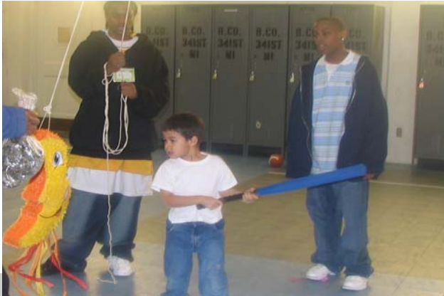
Ft. Lewis Youth Volunteers help with piñata duty at Camp Murray's Holiday Celebration.

The next venture for the partnership will be February 25 th , when the youth team up to host Fear Factor on Fort Lewis (look for further details in this newsletter).