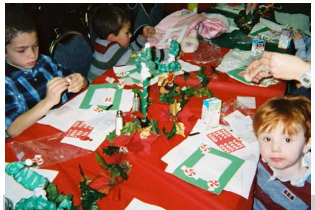
Children in Pasco were busy with fun crafts during their Holiday Celebration.