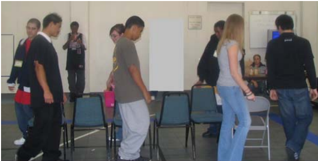
Camp Murray & Ft. Lewis Youth Volunteers get a chance to play musical chairs at Camp Murray's Holiday Celebration.