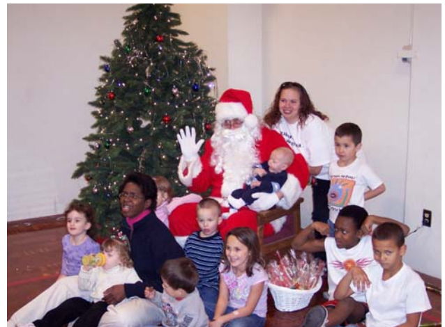
Olympia families huddle around Santa at their Holiday Celebration