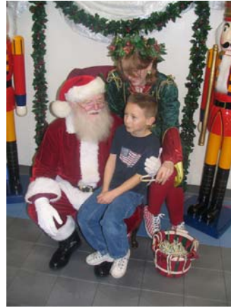
Santa & Holly Elf visited the children at Camp Murray's Holiday Celebration

Family Programs along with volunteers hosted several Holiday Celebrations throughout the state. Many children and their parents enjoyed these events. Families got to visit with Santa, make crafts, play games, and open gifts. Each location had different activities for the families to enjoy.